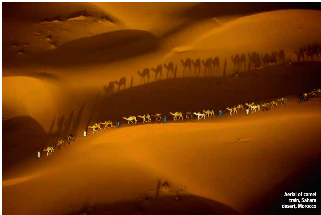
Aerial of camel train, Sahara desert, Morocco