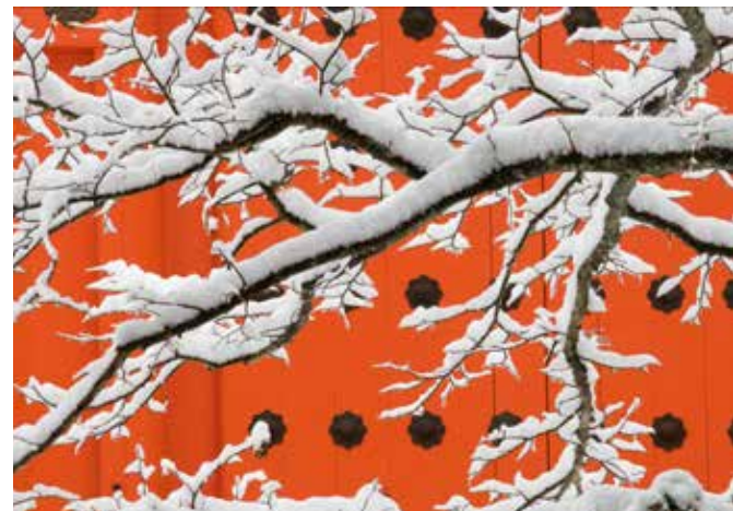
Snow-covered branches in front of a brightly coloured wall create a peaceful scene at the Koyasan Shingon Temples in Japan