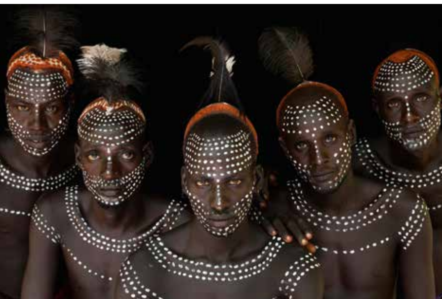
Above: Karo warriors, Omo River Valley, Ethiopia

of people living in traditional ways. Wolfe is keen to point out that it's not a career retrospective, as he isn't quite ready to hang up his camera, but it is a look back over some of the highlights so far. 'When I've worked on books in the past, I've deliberately adopted a different style for a particular subject,' he says. 'For example, Migrations was about patterns in nature and Vanishing Act was about camouflage in the wild, and was shot using long, impressionistic exposures. This book